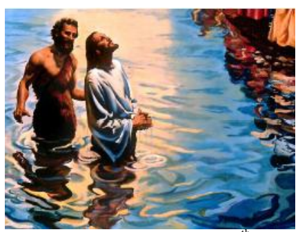
The Baptism of Jesus begins the 70<sup>th</sup> week.

The 7 weeks and 62 weeks equal 483 prophetic days or 483 years. This means, counting ahead 483 years from 457 B.C. we are brought to the time of the Messiah, i.e. Jesus Christ. The date comes to 27 A.D.