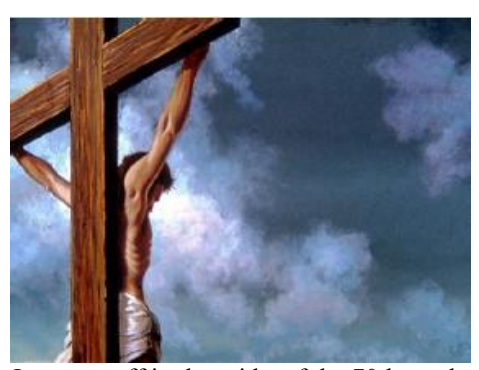
Jesus cut off in the midst of the 70th week.

AND AFTER THE SIXTY-TWO WEEKS MESSIAH SHALL BE CUT OFF, but not for Himself; and the people of the prince who is to come shall destroy the city and the sanctuary. The end of it shall be with a flood, and till