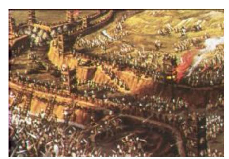
The Destruction of Jerusalem.

The martyrdom of Stephen. A far deeper significance is attached to the stoning of Stephen than may appear to the casual reader. It clinches the former rejection of the Gospel by responsible Jewish leaders at Jerusalem (Acts 7:51-54). It precipitates a new era in Gospel expansion. Exclusive labour for Jews abruptly ceases. Christian witnesses, scattered by the sudden outburst of savage persecution, are impelled to evangelise the Gentiles. Samaritans and the Ethiopian eunuch are the first-fruits from among non-Jews (Acts 8:1,4,5,27,29).