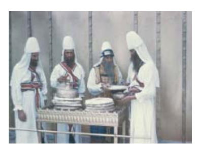
Tithe was used to support the priests attending to the Sanctuary service.

Numbers 18:20,21 Then the LORD said to Aaron: "You shall have no inheritance in their land,