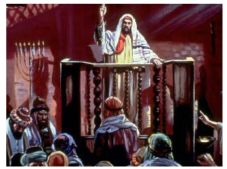
Paul commended the Bereans for searching the Bible every day.

These were more fair-minded than those in Thessalonica, in that they received the word with all readiness, and SEARCHED THE SCRIPTURES DAILY to find out whether these things were so.