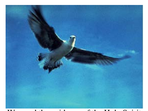
We need the guidance of the Holy Spirit to understand the Bible.

Matthew 7:21 Not everyone who says to Me, 'Lord, Lord,' shall enter the kingdom of heaven, but he who DOES THE WILL OF MY FATHER in heaven.