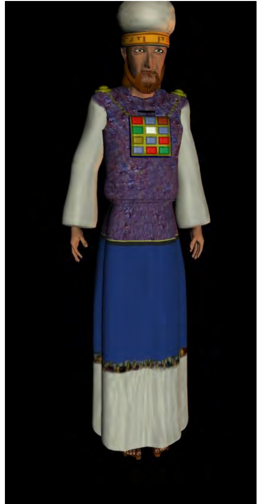
Robes of the High Priest

Now, over those four white garments, the high priest had other garments that were for "glory and beauty." The first was a robe of blue wool, woven in one piece, reaching from his shoulders to below his knees. It was without sleeves. On the hem of this robe of blue were arranged golden bells and pomegranates. These pomegranates were made of blue, purple, and scarlet wool in the shape of pompoms.