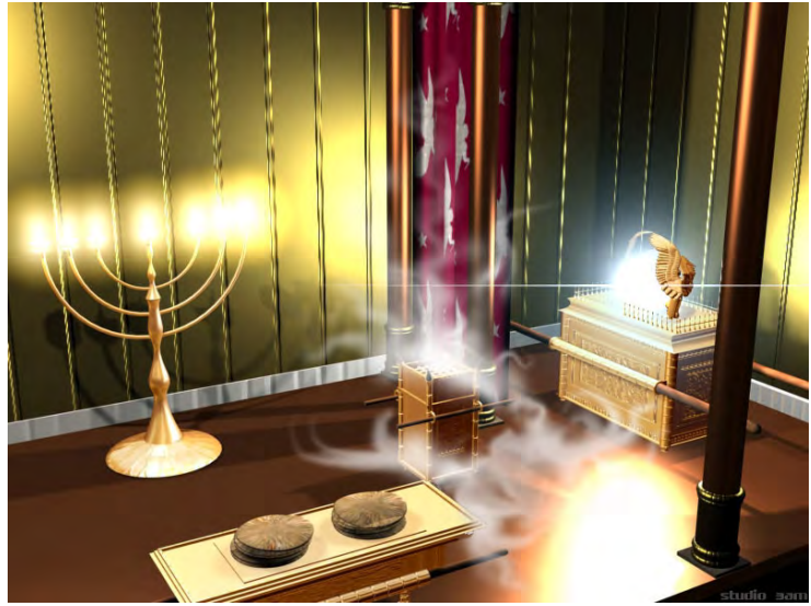
The Holy and Most Holy Place

portrayed so magnificently on Calvary's cross. When the shewbread was taken away on Sabbath morning to be eaten by the outgoing priests, the incoming priests, having prepared their contribution of the shewbread, placed the loaves on the table. When the shewbread was removed, priests took the incense in the bowls on each pile of loaves and offered it on the golden altar as thanksgiving before the Lord for His goodness. So the cross of Calvary is stamped on every loaf of bread. It is because Jesus Christ's merits and intercession are given to us that we are not destroyed and that the divine blessings are multiplied to us every day.