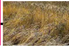
First Fruits Nissan 16 First Month Lev 23:9-14