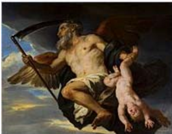
Chronos and his Child by Giovanni Francesco Romanelli, National Museum in Warsaw, a 17th-century depiction of Titan Cronus as "Father Time," wielding a harvesting scythe

It is a Greek mythology. "Chronos already was confused with, or perhaps consciously identified with, the Titan Cronus", different spelling, same pronunciation, the Titans were different to the Olympians but they had similar. "The identification became more widespread during the Renaissance, giving rise to the allegory of 'Father Time' wielding the harvesting scythe." He is the great harvester. Here you have a picture of Chronos clipping the wings of Cupid. What does that suggest? That love is going to be cut down. We have other pictures of him.