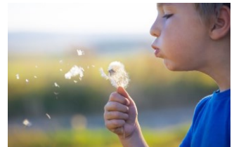
We breathe out Carbon Dioxide

dioxide. What is super amazing is that, after we breathe in oxygen, we blow out carbon dioxide. This is how the trees are able to breathe. They give us oxygen, and we give them carbon dioxide. It’s a big circle of giving!