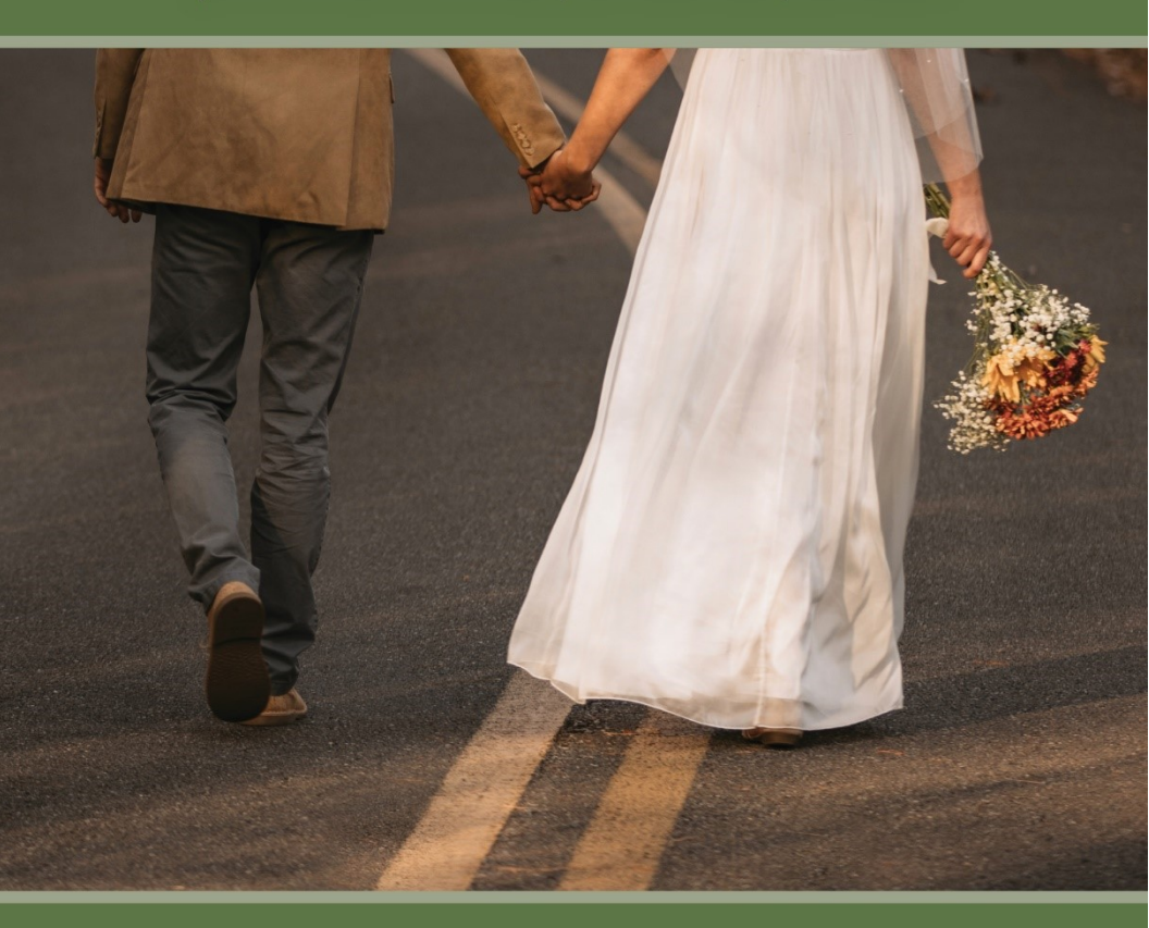
"Therefore what God has joined together, let not man separate." Mark 10:9

If you share this desire, we invite you to partake of the fruits of this study with us, that you may likewise receive the transforming power of God's Word into your hearts and your homes.