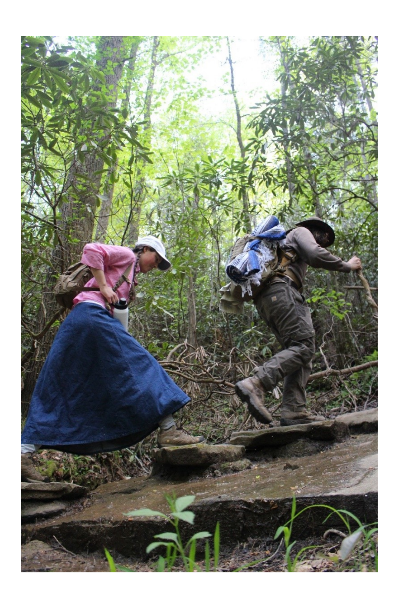
II Timothy 4:7-8 "I have fought the good fight, I have finished the race, I have kept the faith. Finally, there is laid up for me the crown of righteousness, which the Lord, the righteous Judge, will give to me on that Day, and not to me only but also to all who have loved His appearing."