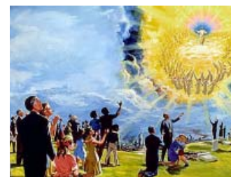
The righteous raised from the dead at the Second Coming.

1 Corinthians 13:12 For NOW WE SEE IN A MIRROR, DIMLY, but then face to face. Now I know in part, but then I shall know just as I also am known.