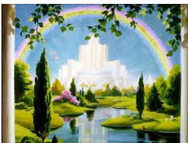
The Third Heaven – where God dwells.

Hebrew 11:10,16 For he WAITED FOR THE CITY which has foundations, WHOSE BUILDER AND MAKER IS GOD. But now THEY DESIRE A BETTER, THAT IS, A HEAVENLY COUNTRY. Therefore God is not ashamed to be called their God, for He has PREPARED A CITY FOR THEM.