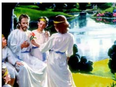
What a wonderful place it will be.

Revelation 22:14,15 Blessed are THOSE WHO DO HIS COMMANDMENTS, that they may HAVE THE RIGHT TO THE TREE OF LIFE, and may enter through the gates into the city. But outside are dogs and sorcerers and sexually immoral and murderers and idolaters, and whoever loves and practices a lie.