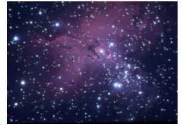
The Second Heaven – the realm of the sun, moon, stars.

To picture the glories of this eternal land is beyond our comprehension. Our wildest imaginations cannot conceive what heaven is really like. We only know God’s promises are sure, and if He has promised these things, and by faith we accept them, then, if we remain faithful, we will one day receive them.