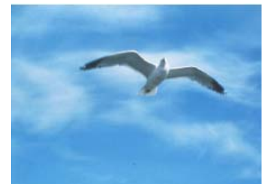
The First Heaven – the realm of birds and clouds.

Matthew 6:9 In this manner, therefore, pray: OUR FATHER IN HEAVEN, Hallowed be Your name.