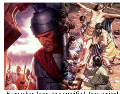
Even when Jesus was crucified, they waited until after the Sabbath to embalm His body.

Luke 23:54,56; 24:1 That day was the PREPARATION, and the SABBATH DREW NEAR. Then they returned and prepared spices and fragrant oils. And they RESTED ON THE SABBATH ACCORDING TO THE COMMANDMENT. Now on THE FIRST DAY OF THE WEEK, very early in the morning, they, and certain other women