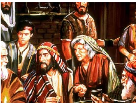
The disciples gathered on the first day of the week not for worship but for fear of the Jews.

John 20:19 Then, the same day at evening, being THE FIRST DAY of the week, when the doors were shut where the disciples were assembled, FOR FEAR OF THE JEWS , Jesus came and stood in the midst, and said to them, " Peace be with you. "