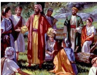
Christians met by a riverside on Sabbath when no synagogue was available.

And from there to Philippi, which is the foremost city of that part of Macedonia, a colony. And we were staying in that city for some days. And ON THE SABBATH day we went out of the city to the riverside, where prayer was customarily made; and we sat down and spoke to the women who met there .