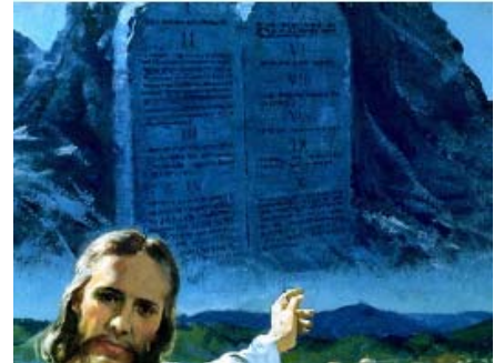
Jesus said don't think I came to destroy the law.

Do not think that I came to destroy the Law or the Prophets. I did not come to destroy but to fulfill. For assuredly, I say to you, TILL HEAVEN AND EARTH PASS AWAY, ONE JOT OR ONE TITTLE WILL BY NO MEANS PASS FROM THE LAW till all is fulfilled. Whoever therefore breaks one of the least of these commandments, and teaches men so, shall be called least in the kingdom of heaven; but whoever does and teaches them , he shall be called great in the kingdom of heaven.