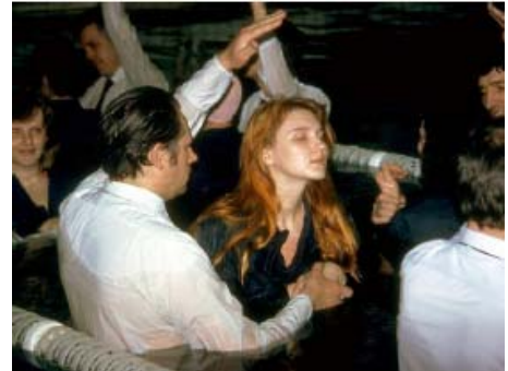
The rite of baptism is symbolic of the death, burial and resurrection of Jesus. We commemorate His resurrection by baptism not worship on Sunday.

By partaking of the symbols of bread and wine in the communion service, we are remembering Christ's death at Calvary. The bread reminds us of His broken body, and the wine of His shed blood to cover our sins. By this service we remember His death.