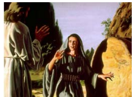
Jesus appears to Mary on the first day of the week.

John 20:1 Now on THE FIRST DAY of the week Mary Magdalene went to the tomb early,