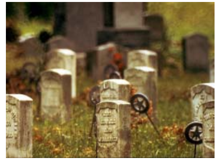
The dead know not anything.

Ecclesiastes 9:5,6 For the living know that they will die; But the DEAD KNOW NOTHING, and they have no more reward, for the memory of them is forgotten. Also THEIR LOVE, THEIR HATRED, AND THEIR ENVY HAVE NOW PERISHED; nevermore will they have a share in anything done under the sun.