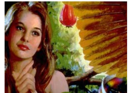
Adam & Eve were tempted to believe that they were immortal.

The devil would have Adam and Eve believe they were immortal (not subject to death) but here it is clearly taught that our bodies are mortal (subject to death). Many today believe man is naturally immortal, even if he has been the worst of sinners, and that some part of him will never die. Millions have been deceived by the devil's assurance: "You will not surely die".