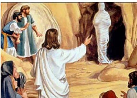
Jesus raises Lazarus from the sleep of death.

John 11:11-14 These things He said, and after that He said to them, “OUR FRIEND LAZARUS SLEEPS, but I go that I may wake him up.” Then His disciples said, “Lord, if he sleeps he will get well.” However, Jesus spoke of his death, but they thought that He was speaking about taking rest in sleep. THEN JESUS SAID TO THEM PLAINLY, “LAZARUS IS DEAD”.