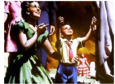
The resurrection of the righteous.

1 Corinthians 15:19,20 If in this life only we have hope in Christ, we are of all men the most pitiable. But now CHRIST IS RISEN FROM THE DEAD, and has BECOME THE FIRSTFRUITS OF THOSE WHO HAVE FALLEN ASLEEP.