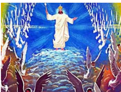
At the Second Coming of Jesus – Death will be conquered.

Some are concerned for those who have died in some terrible way, and the body has been mangled or eaten by wild animals, or some other tragic thing has happened. There is no need to be concerned. God promises in 1 Corinthians 15 to give us a new incorruptible body. We will not possess the same atoms of flesh we now have. In the meantime, God preserves our individual personality and character, then just as He created Adam, so He will re-create us – perfect – to live forever.