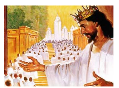
Jesus welcomes saints into heaven.

longsuffering toward us, not willing that any should perish but that all should come to repentance.