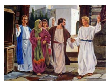
Lot and family escorted out of Sodom.

Sodom and Gomorrah were destroyed by fire many thousands of years ago, yet this text calls the fires of destruction 'eternal fire'. Are these fires burning today? Of course not. Everlasting fire simply means that the fire is eternal in its effects. The everlasting fire at the end of time will destroy the wicked for all time, just as Sodom and Gomorrah were annihilated with never a hope of recovery.