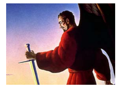
Satan will be burnt to ashes.

Thou hast defiled thy sanctuaries by the multitude of thine iniquities, by the iniquity of thy traffick; therefore will I bring forth A FIRE FROM THE MIDST OF THEE, it shall devour thee, and I WILL BRING THEE TO ASHES upon the earth in the sight of all them that behold thee. All they that know thee among the people shall be astonished at thee; thou shalt be a terror and NEVER SHALT THOU BE ANYMORE. (KJV)