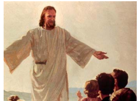
Jesus will stand up for His people.

To keep the Sabbath is a sign that we give our allegiance to God and not to man. The issue is not over whether one day is any better than another, but it is what the day stands for that counts. Sunday observance is a “mark” of the church’s power, but the Sabbath is a “sign” of Christ’s power. If a man stamped on a piece of red, white and blue cloth nobody would be over-concerned. But if that red, white and blue cloth were the Australian flag, patriotic Australians would take very strong exception. It is not the cloth – but what it stands for. The Sabbath is Christ’s holy day, but Sunday is man’s substitute. Depending on which day you keep, shows whose side you are on. It is a matter of allegiance, not just a day.