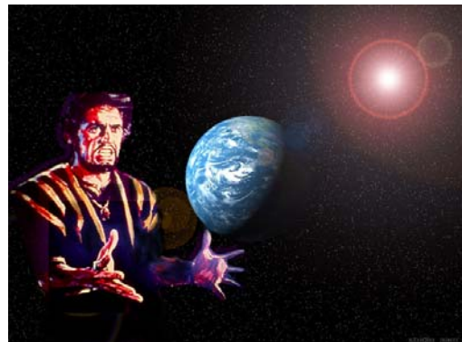
Satan will seek to force the whole world to break God's commandments.