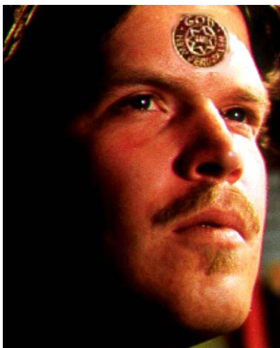
God’s people are sealed by keeping all of God’s commandments.

Exodus 31:16,17 Therefore the children of Israel shall keep the Sabbath, to observe the Sabbath throughout their generations as a perpetual covenant. It is a sign between Me and the children of Israel forever; for in six days the LORD made the heavens and the earth, and on the seventh day He rested and was refreshed.