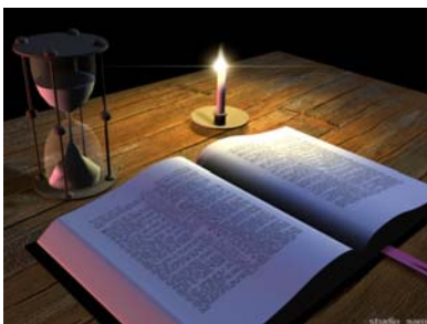
The Catholic Church states that its tradition is equal to the Word of God.

Protestants likewise recognize that this change rests solely upon the authority of the church . They recognize that there is no divine command for Sunday . “The observance of the Lord’s day (Sunday) is founded not on any command of God, but on the authority of the church” – ‘ Augsburg Confession of Faith ’, quoted in ‘ Catholic Sabbath Manual ’, part 2, chapter 1, and section 10.