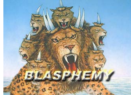
It is blasphemy to assume power to change the law of God.

“A. Had she not such power she could not have done that in which all modern religionists agree with her... She could not have substituted the observance of Sunday, the first day of the week, for the observance of the Saturday, the seventh day of the week, a change for which there is no scriptural authority.” Keenan’s Catechism , page 125.