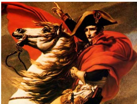
Napoleons General, Berthia took the Pope prisoner in February of 1798.

The wounding of the head was fulfilled in 1798 when Berthia at the head of the French Army, declared the political rule of the Papacy at an end, and took the Pope prisoner to France. However, “the deadly wound was healed”, for in 1929 the Lateran Treaty restored temporal power to the Pope, who was given the rule of the Vatican City. The prophet saw a much greater restoration when the wound was completely healed. Following the healing all but a faithful few would worship the beast. This is still future. The mouth speaking great things and 42 months parallels Daniel 7, when Rome oppressed the people of God during the dark ages.