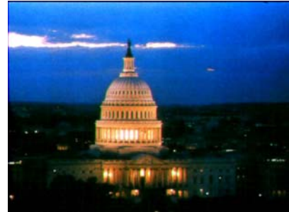
America will make a law enforcing Sunday Worship.

Here are God’s people receiving the “seal of God” before the four winds are let loose on the earth (winds represent strife). These have God’s “mark” of authority upon them. They are His property. In 1 Kings 21:8 we have an example of a king’s seal, which gave the documents proper authorisation. Here in Revelation 7 we see God claim His own children. The “Mark of the Beast” can be received in the forehead or the hand. When we understand the Sabbath-Sunday issue, it becomes clear as to why this is so. The forehead represents the intelligence, and in this case is used to represent an intellectual commitment. The acceptance of Sunday can be accepted intellectually, but some will be forced into observing the day because of law. These receive the mark in the hand (the hand is used for work); many will not have any conscientious belief on the subject. However, the only way the seal of God can be received is by an intellectual commitment to the Sabbath truth. God never uses force when asking men to follow Him. He leaves the choice with the individual. Those who keep the Sabbath, and receive the “seal” will do so because they have willingly chosen to give God their allegiance.