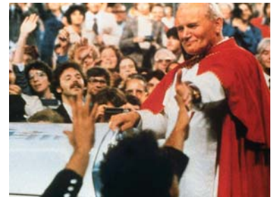
Should we trust man's word instead of the Bible?