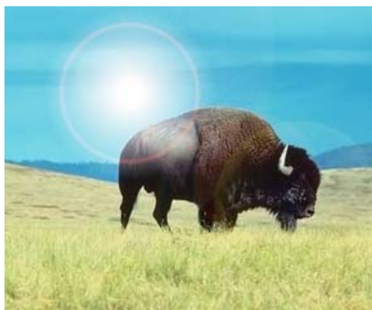
Two horned beast that came out of the earth.