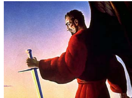
Satan works through men and governments to destroy God’s people.