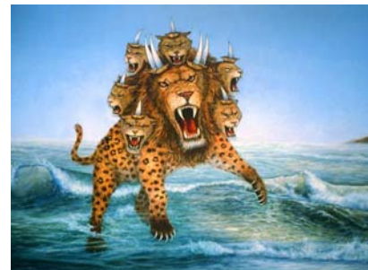
The beast of Revelation 13.

Revelation 13:1-2 Then I stood on the sand of the sea. And I saw a beast rising up out of the sea, having seven heads and ten horns, and on his horns ten crowns, and on his heads a blasphemous name. Now the beast which I saw was like a leopard, his feet were like the feet of a bear , and his mouth like the mouth of a lion. The dragon gave him his power, his throne, and great authority.