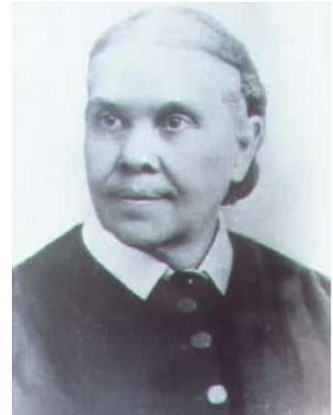
Ellen in later years.

Her writings were never intended to be an addition to Scripture. Rather they were meant to point the reader to the Scriptures, thus leading one to a higher and holier life. She has never been regarded as infallible – she was human – but her messages of truth uplifted the Bible and Jesus Christ. It is true that there are false prophets. Jesus warned His followers to beware. Matthew 7:15-20. He said the test of a true prophet was by his fruits. The fruits of Mrs. White's life reveal her as a genuine Christian. Her life was above reproach.