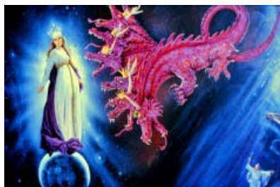
Satan is angry with God's people who have the Testimony of Jesus.

Here are two prophets living at the time of Christ's birth: Simeon and Anna. Some are amazed to think that a woman should fit into the prophetic work, but prophetesses are not uncommon in the Bible. There was Miriam, who prophesied by the Red Sea. There was Deborah, who went into battle with Barak.