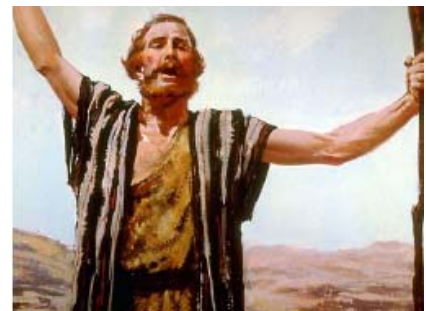
Prophets called people to repentance and gave them messages from God.

What was the purpose of a prophet? Here Ezekiel is said to be a watchman. He gave God's people appropriate warnings of their spiritual dangers to keep them on the straight and narrow path. He was always watching for danger signals to save the people of God from disaster.