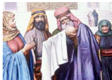
Anna the Prophetess was present at Jesus' birth.

Not only was a prophet a watchman, he was also a messenger; faithfully delivering the message God had given him. Unfortunately the message was not always heeded. The purpose of the prophet was to guide and direct God's people, and to call them to repentance. It is interesting that not all prophets made future predictions, yet this is what many feel is the distinguishing mark of a prophet. Samuel, Ezra and John the Baptist made no predictions of the future. Not all prophets wrote portions of the Bible either; for instance, Elijah and Elisha. The chief work of a prophet was to speak on God's behalf; to be His mouthpiece.