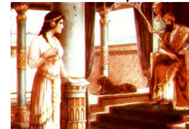
Queen Esther before Artaxerxes

Darius overturns Samaritan intervention by reissuing Cyrus' decree in stronger terms to rebuild the temple in Jerusalem