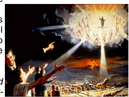
Exhibit 1 Christ's Return From Heaven to Earth It Will be It Will be EARTH-SHAKING PERSONAL It Will be It Will be (Rev 6:12-17) It Will be (Acts 1:9-11: GLORIOUS VISIBLE AUDIBLE I Thess 4:16) (Matt 25:3: (Rev 1:7; (I Thess 4:16,17 Matt 24:27) Matt 24:30) I Cor 15:51,52) The Righteous The Righteous Will be Gath-The Righteous Will Meet ered From the Living Will Christ in the Four Winds The Living be Changed Air (Matt 24:31) Wicked The Righteous (1 Thess 4:16) (1 Thess 4:17) Will Die Dead Will be (2 Thess 1:7,8) Resurrected (1 Thess 4:16) HAPPENINGS ON EARTH

He shall reign forever and ever." (Verse 15)