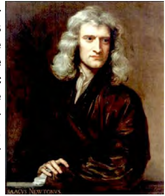
Sir Isaac Newton

Sir Isaac Newton, the famous 18<sup>th</sup> century scientist, was an outstanding student of Daniel's prophecies. In commenting on Daniel 12:4 he claimed that rapid travel would be a mark of the future. He would not be surprised, Sir Isaac Newton said, if one day people could reach the incredible speed of 50 mph! The French philosopher, Voltaire, responded with the comment, "The study of prophecy has led the prince of philosophers to make a fool of himself!""