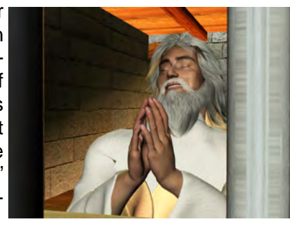
Daniel's ministry comes to a close after many years of faithful service

When the heavenly being said, "Blessed is he that waits for... the 1335 days", he seemed to mean it first of all for Daniel himself; that he might have rest in the hands of the great God who had revealed all these things to him. The end of the 1335 days (years) would doubtless bring him to the eve of the judgment when the books of heaven would be opened and his name would be "found" written there, with the names of the faith-