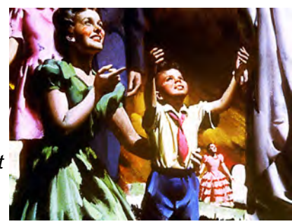
All who have died trusting in Christ will be raised when He returns

READ EXHIBIT 1: Pages 13 FACTS ABOUT THE RESURRECTION