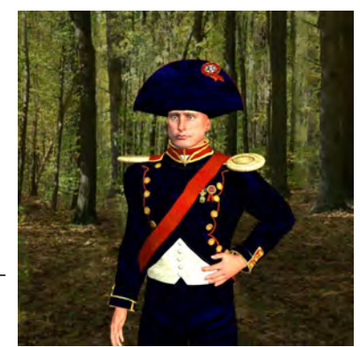
Napoleon ended the rule of the Papacy in 1798

SEE EXHIBIT 3: Pages 14, 15 FOR COMMENTS ON THE 1290 AND THE 1335 DAYS