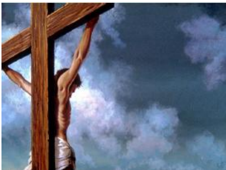
Jesus cut off in the midst of the 70 th week.

Daniel 9:26,27 AND AFTER THE SIXTY-TWO WEEKS MESSIAH SHALL BE CUT OFF, but not for Himself; and the people of the prince who is to come shall destroy the city and the sanctuary. The end of it shall be with a flood, and till the end of the war desolations are determined. Then HE SHALL CONFIRM A COVENANT WITH MANY FOR ONE WEEK; but IN THE MIDDLE OF THE WEEK HE SHALL BRING AN END TO SACRIFICE AND OFFERING. And on the wing of abominations shall be one who makes desolate, even until the consummation, which is determined, is poured out on the desolate.