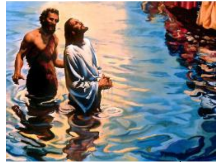
The Baptism of Jesus begins the 70 th week.

The 7 weeks and 62 weeks equal 483 prophetic days or 483 years. This means, counting ahead 483 years from 457 B.C. we are brought to the time of the Messiah, i.e. Jesus Christ. The date comes to 27 A.D.