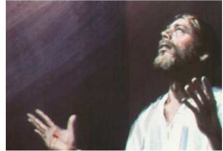
Daniel struggles to fully comprehend the vision but is unable. Before Gabriel finishes the explanation – Daniel faints and the explanation must be continued later in Daniel 9.

Gabriel was unable to continue explanations concerning the vision, because Daniel took sick. All the previous prophecies in the book of Daniel had been explained. The only one left unexplained was the 2,300-day prophecy.