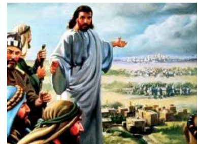
Jesus said in Matt 24:15 that understanding Daniel would be important for the future.

In Daniel Chapter 8 is an interesting prophecy outlining the rise and fall of earthly powers. These are described in more detail in Chapters 2 and 7. In this chapter emphasis is given to the 'little horn' power, which "waxed exceeding great", and brought persecution to God's people. This is explained more fully in another study.