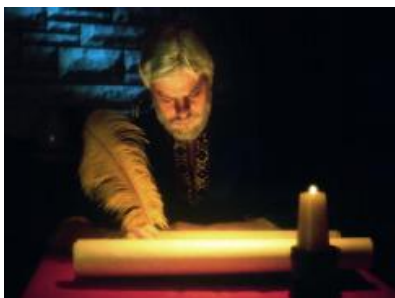
Daniel writes the prophecy.

Daniel 9:24 SEVENTY WEEKS ARE DETERMINED FOR YOUR PEOPLE and for your holy city, to finish the transgression, to make an end of sins, to make reconciliation for iniquity, to bring in everlasting righteousness, to seal up vision and prophecy, and to anoint the Most Holy.