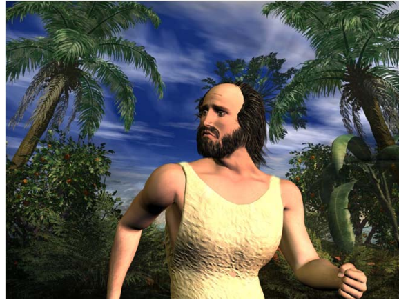
Ham Despises Family Authority

And he said, Cursed be Canaan. He shall be a servant of servants to his brothers. Gen 9:25