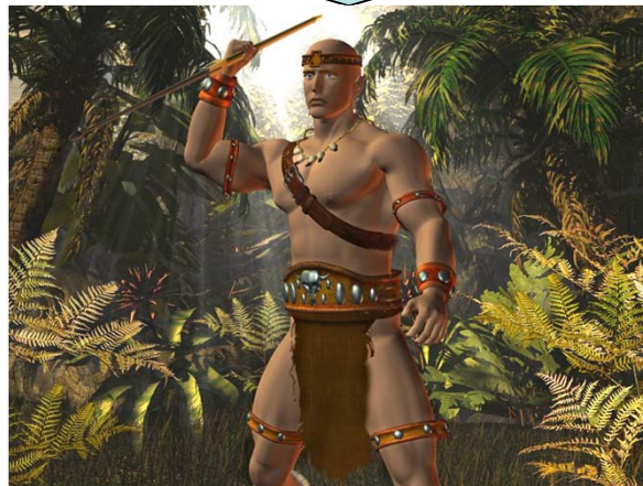
Nimrod, The Mighty Hunter