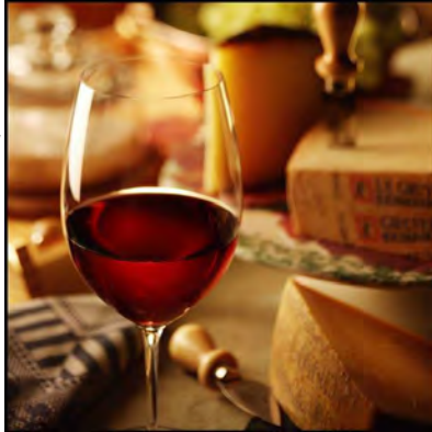
The first test that Daniel and his friends faced was concerning their diet.

he and his friends be allowed to eat vegetables and drink only water for a ten-day trial. Was their health adversely affected? (Verses 12-15)