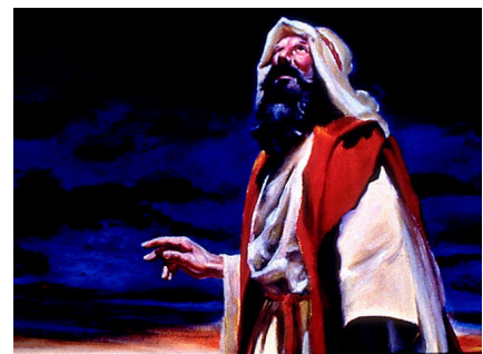
If you are Christ's then you are Abraham's seed. True Jew are those who have faith like Abraham. Gal 3:29, Romans 4:12

3. Some of the Israelites of the Old Testament that overcame by _____ and became the ancestors of Jesus were Canaanites and Moabites that became Spiritual Israelites. A person from any country and _____ can become a Spiritual _____ by faith in Christ. See note below.