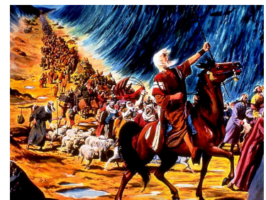
God leads Israel out of Egypt under the leadership of Moses

Soon our eyes were drawn to the east, for a small black cloud had appeared, about half as large as a man’s hand, which we all knew was the sign of the Son of man. We all in solemn silence gazed on the cloud as it drew nearer and became lighter, glorious, and still more glorious, till it was a great white cloud. The bottom appeared like fire; a rainbow was over the cloud, while around it were ten thousand angels, singing a most lovely song; and upon it sat the Son of man. His hair was white and curly and lay on His shoulders; and upon His head were many crowns. His feet had the appearance of fire; in His right hand was a sharp sickle; in His left, a silver trumpet.