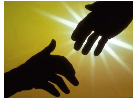
Jesus can heal our backsliding