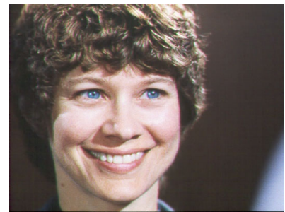
The Tribe of Zebulun had a thankful spirit. It's easier to overcome when we are thankful

Issachar. The ninth son of Jacob and the fifth son of Leah was Issachar Gen 35:23. The meaning of the original Hebrew for this name יִסַּחַר = Yissaskar is "he will bring a reward," or "he will recompense." The blessing of his father Jacob declared "Issachar is a strong ass couching down between two burdens: And he saw that rest was good, and the land that it was pleasant; and bowed his shoulder to bear, and became a servant unto tribute." Gen 49:14,15. The men of Issachar were very supportive to Deborah the prophetess and Barak in battle against their enemies. Judges 5:15. The men of Issachar were men of understanding and knew what to do in the crowning of David 1 Chron 12:32. The men of Issachar were valiant men of might 1 Chron 7:1-5. Tola of the tribe of Issachar was a judge over Israel for twenty-three years Judges 10:1,2. It was a time of rest and peace. Issachar had removed so far from the knowledge of the sanctuary that they did not cleanse themselves. But God accepted their worship through intercessory prayer 2 Chron 30:17-20. Baasha of the tribe of Issachar was king over Israel 1 Kings 15:25-28. The character of Issachar was strong, patient, and hard working. They bear heavy responsibilities. The Issachar type character has good understanding in knowing how to act on important occasions. They are valiant men of might.