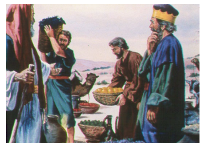
The tribe of Naphtali bring food gifts to King David

Manasseh. Manasseh was the first of Joseph's sons Gen 41:51. The name Manasseh in Hebrew is מְנַשֶּׁה 'Menashsheh which means causing to forget. The reason for his name was given by Joseph his father "For God, said he, hath made me