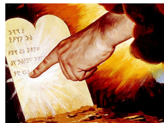
The Ten Commandments written by God's own finger. The only part of the Bible written by God directly

Ans: a. Of the tribe of _____ were sealed twelve thousand. Of the tribe of _____ were sealed twelve thousand. Of the tribe of _____ were sealed twelve thousand. Rev 7:5