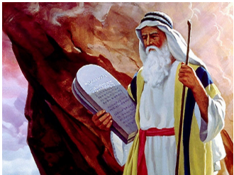
Moses the meekest man in all the earth came from Levi

They shall teach Jacob thy judgments, and Israel thy law: they shall put incense before thee, and whole burnt sacrifice upon thine altar. Bless, LORD, his substance, and accept the work of his hands: smite through the loins of them that rise against him, and of them that hate him, that they rise not again." Deut 33:8-11. Levi observed God's word and kept His covenant. They became priests and judges for Israel. The Levites took the place of the firstborn in ministering as priests for all the families of Israel Num 3:46-49. The Levites had no inheritance of land but had an inheritance of ministry and financial support Num 18:20,21. In the Old Testament Moses and Aaron were the most noted Characters Ex 4:14. In the New Testament Barnabas was of the tribe of Levi Acts 4:36. The Levites that will be ready for the Kingdom of Heaven are strong, loyal, and dependable in a crisis. They helped join the people to their God through intercession and ministry and make patient and powerful leaders. They have overcome a cruel, treacherous, impatient, deceitful tendency. They are talented and intelligent and capable of turning their hand to anything. They are strong in faith and unmovable in principle. They have the ability to perform miracles when God ordains and have a very close connection with God. They are well acquainted and obedient to the law of God and are good teachers.