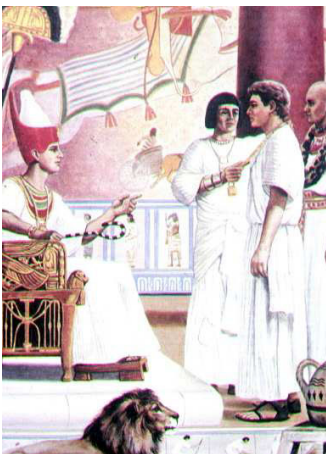
Joseph received a double portion of the inheritance

Joseph. Joseph was the eleventh son of Jacob and the first son of Rachel Gen 30:22-24; 35:24. His name יוֹסֵף = Yowceph is a Hebrew word which means “Jehovah has added.” This was a long waited for blessing and answer to prayer for Rachel who had not been able to bare any children Gen 30:1,22-24. God had answered her prayers after she had seen ten sons born to Jacob without any of her own. Joseph’s blessing from his father Jacob declared “Joseph is a fruitful bough, even a fruitful bough by a well; whose branches run over the wall: The archers have sorely grieved him, and shot at him, and hated him: But his bow abode in strength, and the arms of his hands were made strong by the hands of the mighty God of Jacob; (from thence is the shepherd, the stone of Israel:) Even by the God of thy father, who shall help thee; and by the Almighty, who shall bless thee with blessings of heaven above, blessings of the deep that lieth under, blessings of the breasts, and of the womb: The blessings of thy father have prevailed above the blessings of my progenitors unto the utmost bound of the everlasting hills: they shall be on the head of Joseph, and on the crown of the head of him that was separate from his brethren.” Gen 49:22-26. Joseph was