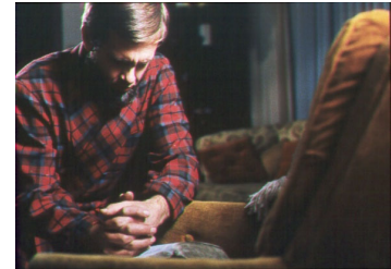
Even those with a rebellious past can overcome as Simeon did

Ans: b. Those that overcome from the tribe of Simeon that will be finally saved are no longer cruel, deceitful, treacherous, murderers, fierce, angry, adulterous, or involved in apostasy but by the blood of the Lamb _____ all hereditary and cultivated tendencies to _____. See note below.