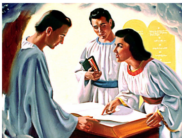
Serving in the temple in Heaven

Ans: Therefore are they before the throne of God, and _____ him day and night in his _____: and he that sitteth on the throne shall dwell among them. They shall hunger no more, neither thirst any more; neither shall the sun light on them, nor any heat. For the _____ which is in the midst of the throne shall _____ them, and shall lead them unto living fountains of waters: and God shall wipe away all tears from their eyes.