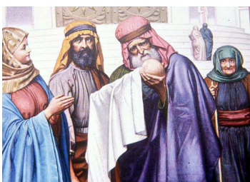
Anna a prophetess, who blessed baby Jesus was of the tribe of Asher

Ans: b. The tribe of Asher represents those of a _____ faithful disposition. They are not noted leaders but are of a _____ nature and very brave when the battle is on. They are good at _____ the gospel in a quiet way being _____ with the Holy Spirit. They uphold the royal _____ as a tasty delicacy and delight. They are _____ and spend much time in prayer and serving the Lord. They are peaceful and friendly standing for truth even when others are mocking.