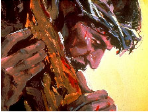
Jesus blood cleanses us from all sin and power of sin.

Ans: a. 11 And they overcame him by the _____ of the Lamb, and by the word of their _____; and they loved not their _____ unto the death. Rev 12:11.