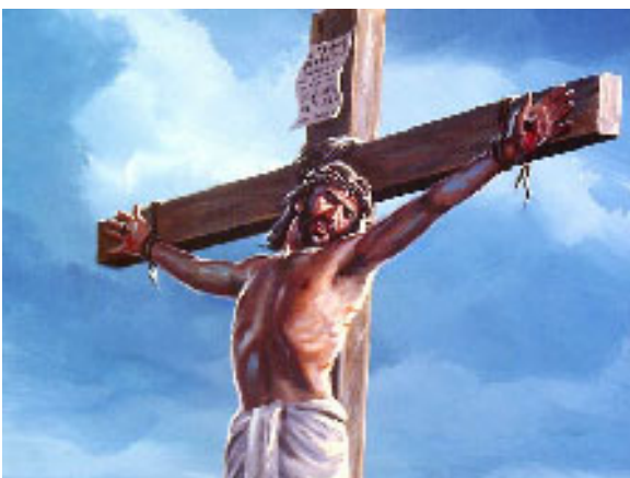
Jesus death and resurrection rescued us from the power of Satan

Ans: e. Satan gains access to heaven again. 6 Now there was a _____ when the _____ of God came to _____ themselves before the _____, and _____ came also among them. 7 And the LORD said unto Satan, Whence comest thou? Then Satan answered the LORD, and said, From going to and fro in the _____, and from walking up and down in it. (Job 1:6,7). Satan was able to return to heaven in a very limited degree as the prince of this world. He tempted Adam to sin and this world became his lawful kingdom. Satan came among all the Adams or leaders of all the other inhabited worlds, and he represented our world (Job 1:7; 2:1; Heb 1:1,2). See note below