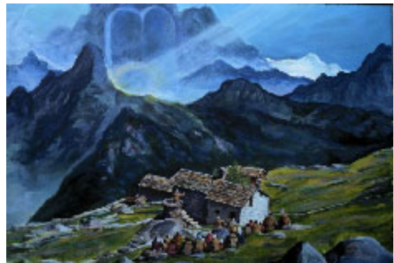
The Waldenses that held to the Bible truths worshipped on the Sabbath day the fourth Commandment that Jesus encouraged His followers to keep after His resurrection Mt 24:20.

Ans: c. That she might fly into the wilderness, into her place. The church found her hiding place in the rocky heights of the _____. The Waldenses who held to the Bible truths and worshipped on the _____ Day Sabbath lived in the _____ valleys north of Italy. The _____ lived in the secluded recesses of the high Alps in the south of _____. This was where the pure gospel was preserved for hundreds of years and helped spark the flames of the reformation that set the whole world on fire with the torch of truth with its missionaries who risked and often lost their lives in spreading the Bible message.