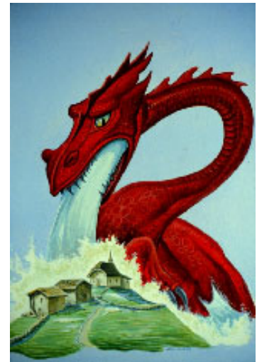
The dragon or serpent symbolically cast a flood out of his mouth after the woman. This was a figure of the armies that hunted the true believers like animals in the mountains.

In the Saviour's conversation with His disciples upon Olivet, after describing the long period of trial for the church,--the 1260 years of papal persecution, concerning which He had promised that the tribulation should be shortened (Mt 24:22), The 1260 days, or years, terminated in 1798. A quarter of a century earlier, persecution had almost wholly ceased.