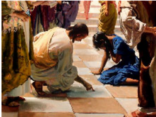
Jesus showed His great power in forgiving us our sins and giving us the ability to overcome all weaknesses in our character

Ans: g. And I heard a loud voice saying in Heaven. Loud voices are heard from heaven or in heaven 12 times in Revelation usually either as a great _____ or as a great _____ which God wants us to hear for our happiness and salvation or some great event about to happen. (Rev 5:2,12; 6:10; 7:2,10; 8:13; 10:3; 12:10; 14:7,9,15; 19:17). See note below.