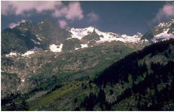
The mountains where the Waldenses fled and hid during their terrible persecution for following and believing the Bible

And to the Woman were given two wings of a great eagle. The true church of God was hiding in the wilderness, under the care of God, in a similar way that the Israelites were protected, and preserved by God for forty years in the wilderness around Mount Sinai. The angels of God were around to guard and protect them from being wiped out completely by the severe persecution.