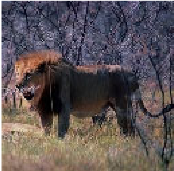
Satan is going about like a roaring lion knowing that His time is short. But he and all his angels are no match for even the weakest of Christians that has Jesus as his protector

Ans: d. Great Wrath. 8 Be sober, be vigilant; because your adversary the _____, as a roaring _____, walketh about, seeking _____ whom he may _____: 1 Pet 5:8.