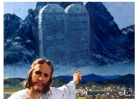
The Remnant Church will keep the Sabbath with all the other commandments that Jesus has asked us to keep.

Paul the apostle to the Gentiles also taught that there remained a Sabbath keeping to the people of God.