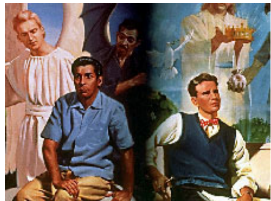
Those that overcome Satan and all his temptations, would rather die that disappoint their best friend Jesus, by sinning against Him.

God desires that the receivers of His _____ shall be _____ to its power. Those whose course has been most offensive to Him He freely accepts; when they _____, He imparts to them His divine Spirit, places them in the highest positions of trust, and sends them forth into the camp of the disloyal to proclaim His boundless _____. He would have His servants bear _____ to the fact that through His grace men may possess Christlikeness of _____, and may rejoice in the assurance of His great love. He would have us bear _____ to the fact that He cannot be satisfied until the human race are reclaimed and reinstated in their holy privileges as His sons and daughters. See note below.