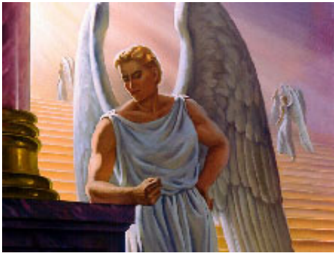
Satan rebelled in heaven against God and His law of love

Ans: c. Which deceiveth the whole world. "As Moses lifted up the serpent in the wilderness," even so was the Son of man "lifted up: that whosoever believeth in Him should not perish, but have eternal life." John 3:14, 15. _____ who have ever lived upon the earth