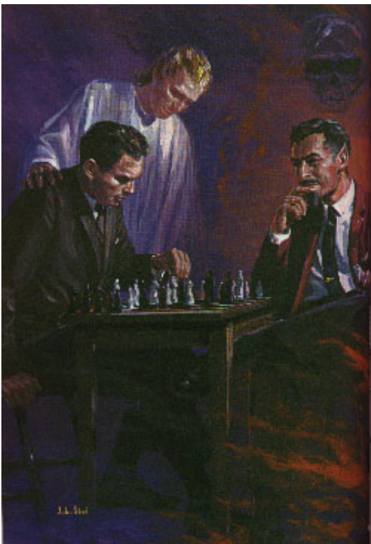
Christ has given us the great power to overcome sin and Satan in the game of life.

In his _____ strength, man cannot meet the charges of the enemy. In sin-stained garments, confessing his guilt, he stands before God. But Jesus, our Advocate, presents an effectual plea in behalf of all who by repentance and faith have committed the keeping of their souls to Him. He pleads their cause, and by the mighty _____ of _____, vanquishes their _____. See note below.