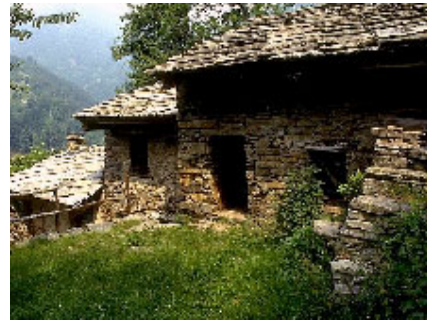
The homes of the Waldenses who laid down their lives for following the Bible instead of the traditions of Rome

Ans: c. Persecuted the Women. As soon as Jesus ascended to heaven after His resurrection the _____ started. It came first from the _____ who had rejected Christ as the Messiah (Acts 7:56-60; 8:1-4). Later Nero, Diocletion and other _____ Emperors were responsible for the _____ of many Christians. But by far the greatest and most intense period, that would have destroyed not only the truth, but every living Christian, was the 1260 years of _____ persecution (Mt 24:22). Century after century the blood of the saints had been shed. While the _____ laid down their lives upon the mountains of Piedmont "for the word of God, and for the testimony of Jesus Christ," similar witness to the truth had been borne by their brethren, the _____ of France. In the days of the Reformation its disciples had been put to death with horrible _____. King and nobles, highborn women and delicate maidens, the pride and chivalry of the nation, had feasted their eyes upon the _____ of the martyrs of Jesus. The brave Huguenots, battling for those rights which the human heart holds most sacred, had poured out their blood on many a hard-fought field. The Protestants were counted as outlaws, a price was set upon their heads, and they were hunted down like _____ beasts. See note below.