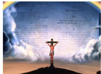
Jesus paid the price for us breaking the law of God and cast down Satan our accuser forever when we accept our Saviour into our hearts

Ans: c. 24 For _____ is not entered into the holy places made with hands, which are the figures of the true; but into _____ itself, now to appear in the presence of God for _____: Heb 9:24.