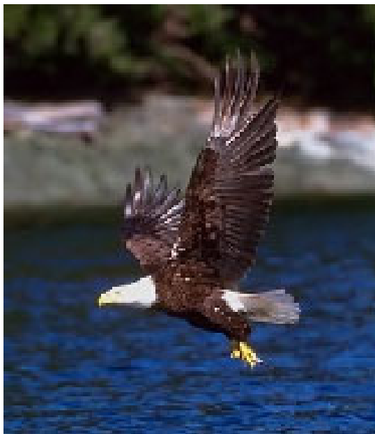
To the church were symbolically given two wings of a great eagle. This represented the speed that God gave His faithful followers to flee into the high rocky mountains just as the eagles do.

Persecuted the Women. As soon as Jesus ascended to heaven after His resurrection the persecution started. It came first from the Jews who had rejected Christ as the Messiah (Acts 7:56-60; 8:1-4). Later Nero, Diocletion and other Roman Emperors were responsible for the death of many Christians. But by far the greatest and most intense period, that would have destroyed not only the truth, but every living Christian, was the 1260 years of Papal persecution (Mt 24:22). Century after century the blood of the saints had been shed. While the Waldenses laid down their lives upon the mountains of Piedmont "for the word of God, and for the testimony of Jesus Christ," similar witness to the truth had been borne by their brethren, the Albigenses of France. In the days of the Reformation its disciples had been put to death with horrible tortures. King and nobles, highborn women and delicate maidens, the pride and chivalry of the nation, had feasted their eyes upon the agonies of the martyrs of Jesus. The brave Huguenots, battling for those rights which the human heart holds most sacred, had poured out their blood on many a hard-fought field. The Protestants were counted as outlaws, a price was set upon their heads, and they were hunted down like wild beasts.