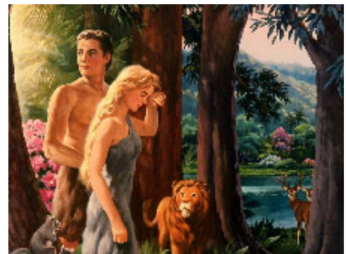
When he tempted and overcame Adam and Eve, Satan thought that he had gained possession of this world

44 Ye are of your _____ the _____, and the lusts of your father ye will do. He was a murderer from the beginning, and abode not in the truth, because there is no truth in him. When he speaketh a lie, he speaketh of his own: for he is a liar, and the father of it. Jn 8:44.