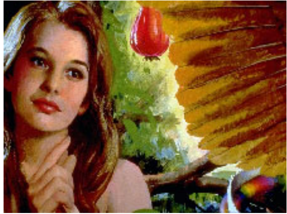
Christ has given us power to resist every temptation of Satan our accuser no mater how great it may be.

So the throne of glory represents the kingdom of glory; and this kingdom is referred to in the Saviour's words: "When the Son of man shall come in His glory, and all the holy angels with Him, then shall He sit upon the throne of His glory: and before Him shall be gathered all nations." Matthew 25:31, 32. This kingdom is yet future. It is not to be set up until the Second Advent of Christ.