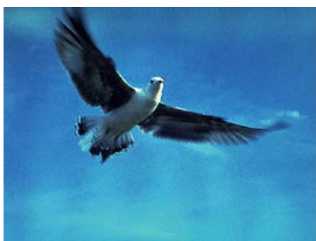
We need the guidance of the Holy Spirit to understand the Bible.

Matthew 7:21 Not everyone who says to Me, ‘Lord, Lord,’ shall enter the kingdom of heaven, but he who DOES THE WILL OF MY FATHER in heaven.