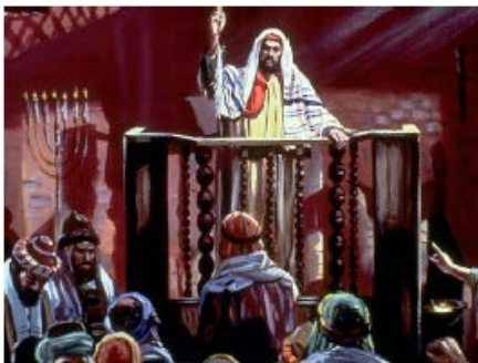
Paul commended the Bereans for searching the Bible every day.

These were more fair-minded than those in Thessalonica, in that they received the word with all readiness, and SEARCHED THE SCRIPTURES DAILY to find out whether these things were so.