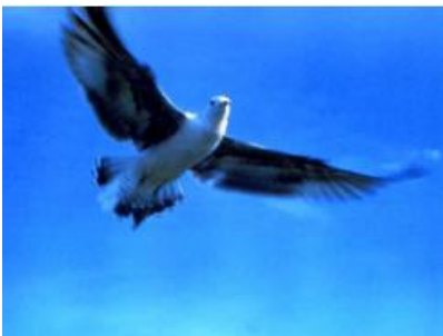
We are sanctified by the Holy Spirit.

Hebrews 10:16 This is the covenant that I will make with them after those days, says the LORD: I WILL PUT MY LAWS INTO THEIR HEARTS, AND IN THEIR MINDS I WILL WRITE THEM.