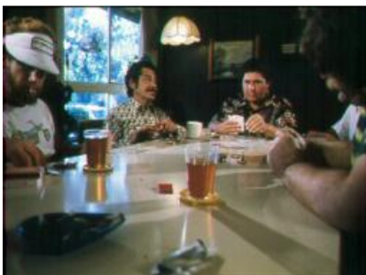
As Christians we make a determined effort with Christ’s grace to resist worldly habits.

Growing in grace is not automatic after one has accepted Jesus as his Saviour. We cannot sit back and say, “Take over God”. Christ works through us, not independently of us. Our part is to place our will on