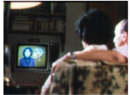
As God's children we will seek more of God's Word and less of the world's words.

While it is true that the sanctified Christian will become more Christlike, and through Christ's power in his life he will forsake sin, it is nonetheless true that the sinful nature is still present. If he claims to be sinless, he is in grave error. The sinful nature, even though subdued, will remain until the second coming of Christ. The saved Christian will then find "redemption of the body" – his sinful nature gone – but not until then.