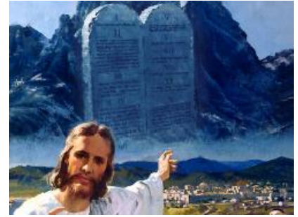
Jesus wants us to demonstrate our love for him by trusting that His grace can help us keep His commandments.

Faith and the law cannot be separated. We are not saved by faith and a rejection of the law; we are saved by faith alone, and this faith alone, leads us to honour or “establish” God’s law. Obedience is indeed, the fruit of faith. “The just shall live by faith,” Romans 1:17.