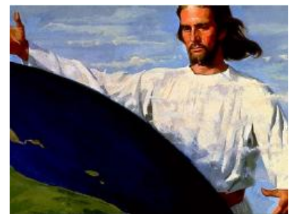
We love Jesus because He first loved us.

2. That Christ releases man from obedience to His law because man is saved by faith alone.