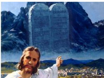
Obedience is essential for answered prayer.

If a person has been convicted to keep God's commandments, and refuses to listen, be it a great matter or small, God regards his prayer as an abomination. It is a mistake to think God will accept the prayers of a professed Christian, while willingly he disobeys God's commandments.