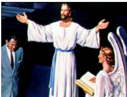
Our prayers are heard because Jesus intercedes for us.

Prayer is not for proud display. Private prayer is between God and the individual. Christ admonished His followers to enter into a private room, shut the door, and pray in secret. This will crowd out influences that will distract from seeking God, and thus allow concentration. Public prayer does have its place, and when used, these prayers should be short. Private praying has no time limit, but public prayers are different. The one chosen to pray is not trying to impress others; he is instead, the spokesman, speaking on behalf of those who have gathered together.