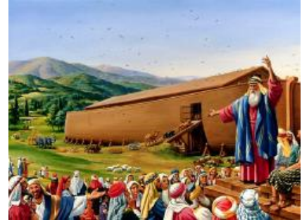
Noah demonstrated faith in God by obeying God's word. We also need faith.

Hebrews 11:6 BUT WITHOUT FAITH IT IS IMPOSSIBLE TO PLEASE HIM , for he who comes to God must believe that He is, and that He is a rewarder of those who diligently seek Him.