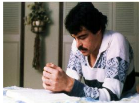
Prayer is the breath of the soul.

When we pray to Our Father in heaven, we make our petitions through the name of Jesus. The promise is given that our prayers will be answered.