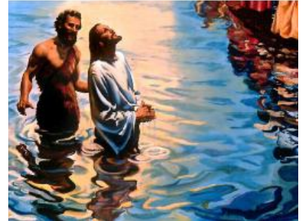
The Baptism of Jesus begins the 70 th week.

The 7 weeks and 62 weeks equal 483 prophetic days or 483 years. This means, counting ahead 483 years from 457 B.C. we are brought to the time of the Messiah, i.e. Jesus Christ. The date comes to 27 A.D.