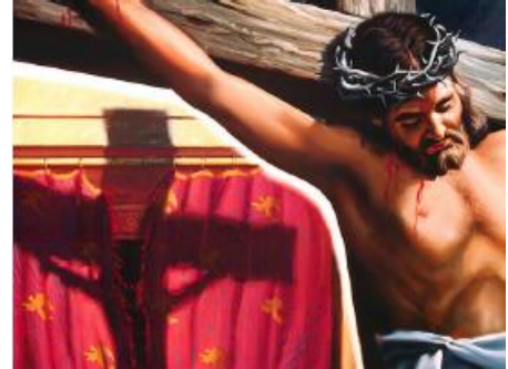
Veil torn when Jesus died.

No longer were animal sacrifices needed. The One great Sacrifice, Jesus, was the One all other sacrifices pointed to. He caused the sacrificial system to cease.