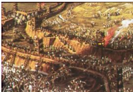
The Destruction of Jerusalem.

The martyrdom of Stephen. A far deeper significance is attached to the stoning of Stephen than may appear to the casual reader. It clinches the former rejection of the Gospel by responsible Jewish leaders at Jerusalem (Acts 7:51-54). It precipitates a new era in Gospel expansion. Exclusive labour for Jews abruptly ceases. Christian witnesses, scattered by the sudden outburst of savage persecution, are impelled to evangelise the Gentiles. Samaritans and the Ethiopian eunuch are the first-fruits from among non-Jews (Acts 8:1,4,5,27,29).