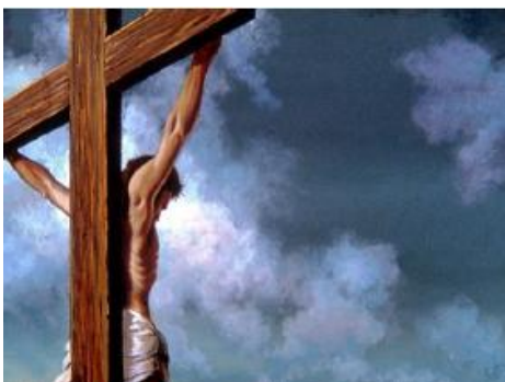
Jesus cut off in the midst of the 70th week.

Daniel 9:26,27 AND AFTER THE SIXTY-TWO WEEKS MESSIAH SHALL BE CUT OFF, but not for Himself; and the people of the prince who is to come shall destroy the city and the sanctuary. The end of it shall be with a flood, and till the end of the war desolations are determined. Then HE SHALL CONFIRM A COVENANT WITH MANY FOR ONE WEEK; but IN THE MIDDLE OF THE WEEK HE SHALL BRING AN END TO SACRIFICE AND OFFERING. And on the wing of abominations shall be one who makes desolate, even until the consummation, which is determined, is poured out on the desolate.