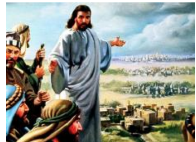
Jesus said in Matt 24:15 that understanding Daniel would be important for the future.

In Daniel Chapter 8 is an interesting prophecy outlining the rise and fall of earthly powers. These are described in more detail in Chapters 2 and 7. In this chapter emphasis is given to the 'little horn' power, which "waxed exceeding great", and brought persecution to God's people. This is explained more fully in another study.