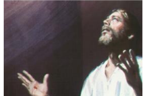
Daniel struggles to fully comprehend the vision but is unable. Before Gabriel finishes the explanation – Daniel faints and the explanation must be continued later in Daniel 9.

Gabriel was unable to continue explanations concerning the vision, because Daniel took sick. All the previous prophecies in the book of Daniel had been explained. The only one left unexplained was the 2,300-day prophecy.