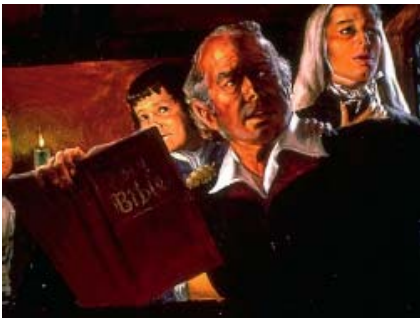
The Bible was forbidden to be read by laymen during the dark ages.

“SPEAK POMPOUS WORDS AGAINST THE MOST HIGH.” The Papacy has done this. e.g. The Catholic National , July 1895. “The Pope is not only the representative of Jesus Christ, but He is Jesus Christ Himself, hidden under the veil of flesh.”