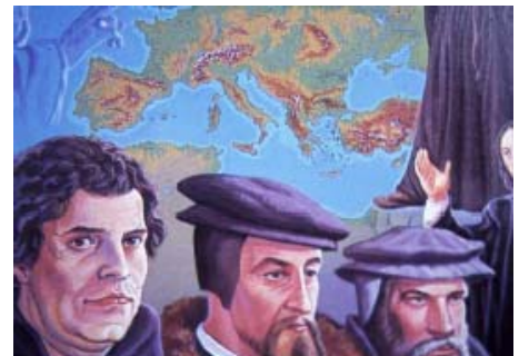
Reformers like Luther, Tyndale & Calvin identified the Papacy as the Antichrist.

Up till the Revolution, France had been a leading supporter of the Papacy for many centuries, and was called “The Eldest Son of the Church”. Consequently this disaster brought to an end the age-long political supremacy of the bishop of Rome, and dealt the Papacy a wound from which it has not yet fully recovered.