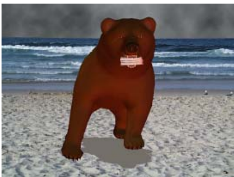
The bear represents Medo Persia.

Daniel 7:5 And suddenly another beast, A SECOND, LIKE A BEAR . It was raised up on one side, and had three ribs in its mouth between its teeth. And they said thus to it: “Arise, devour much flesh!”