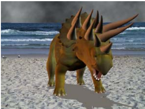
The fourth beast represents Rome.

I was considering the horns, and THERE WAS ANOTHER HORN, A LITTLE ONE, COMING UP AMONG THEM, before whom THREE OF THE FIRST HORNS WERE PLUCKED OUT BY THE ROOTS. And there, in this horn, were eyes like the eyes of a man, and A MOUTH SPEAKING POMPOUS WORDS. Then I wished to know the truth about the fourth beast, which was different from all the others, exceedingly dreadful, with its teeth of iron and its nails of bronze, which devoured, broke in pieces, and trampled the residue with its feet; and the ten horns that were on its head, and the other horn which came up, before which three fell, namely, that horn which had eyes and a mouth which spoke pompous words, whose APPEARANCE WAS GREATER THAN HIS FELLOWS.