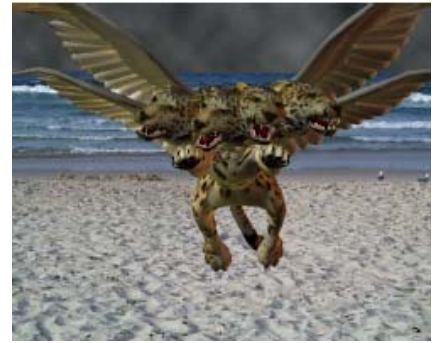
The leopard representing Greece.

The dreadful beast very fittingly represented the fourth successive world empire and that was Pagan Rome. The iron teeth parallel with the iron legs of the image in Daniel 2:40. The ten horns of this fourth beast pictured the break up of power of Pagan Rome into the divisions of Western Europe, which were finally established by the year A.D. 476. This corresponds with the feet and toes of Daniel 2:41-43.