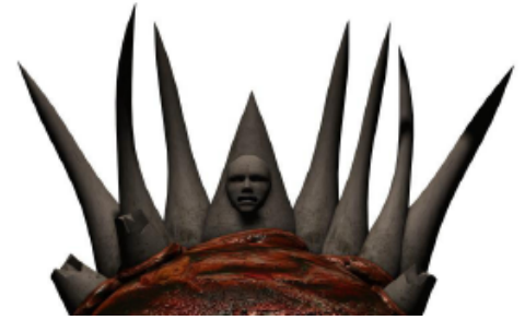
A little horn comes up.

“Arises after the ten horns”. The ten kingdoms were finally established in A.D. 476. The Papacy received her political supremacy and came into prominence at a later date. (Approximately A.D. 538.)