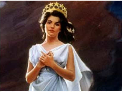
Christ's Bride – the church will always cling to the commandments of God and the faith of Jesus.

“Authoritative Quotations on the Sabbath and Sunday”, “From Sabbath to Sunday”.)