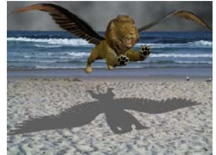
The lion represents Babylon.

Daniel 7:4 The first was like a LION , AND HAD EAGLE’S WINGS . I watched till its wings were plucked off; and it was lifted up from the earth and made to stand on two feet like a man, and a man’s heart was given to it.